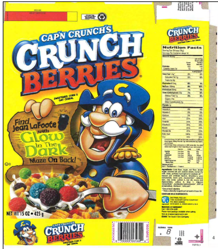
Figure 1 - Image of front and side display panel 1

In or about 1968, The Quaker Oats Company (“Quaker Oats”), now a unit of PepsiCo, began manufacturing and marketing a cereal known as Cap’n Crunch’s Crunch Berries (“Cap’n Crunch”). (First Am. Compl. (“FAC”) ¶ 2, Ex. B at 24.) As shown in fig. 1 below, the front display panel of the cereal box bears the product name, “Cap’n Crunch’s Crunch Berries.” Immediately below is a product description, which states: “SWEETENED CORN & OAT CEREAL.” The display panel also depicts a ship’s captain in cartoon form standing behind a bowl of cereal, and holding a spoonful of multi-colored Crunch Berries. (Id. ¶ 11.) Plaintiff alleges that “the colorful Crunchberries [sic] on the [cereal box], combined with the ‘berry’ in the Product name, conveys only one message: that Cap’n Crunch has some nutritional value derived from fruit.” (Id. ¶ 12.)